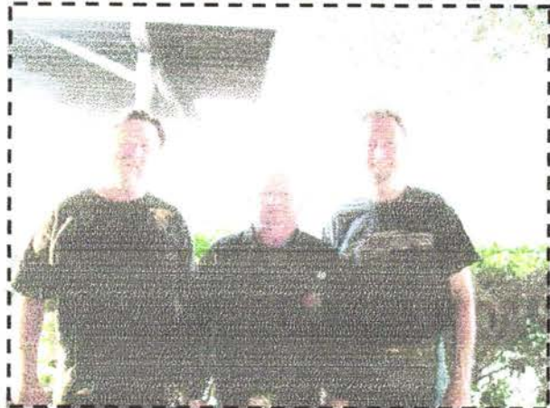
Max P., 2001 Soft Tail Brooks B., 2006 Road King Classic Bruce M., 2004 Soft Tail Standard